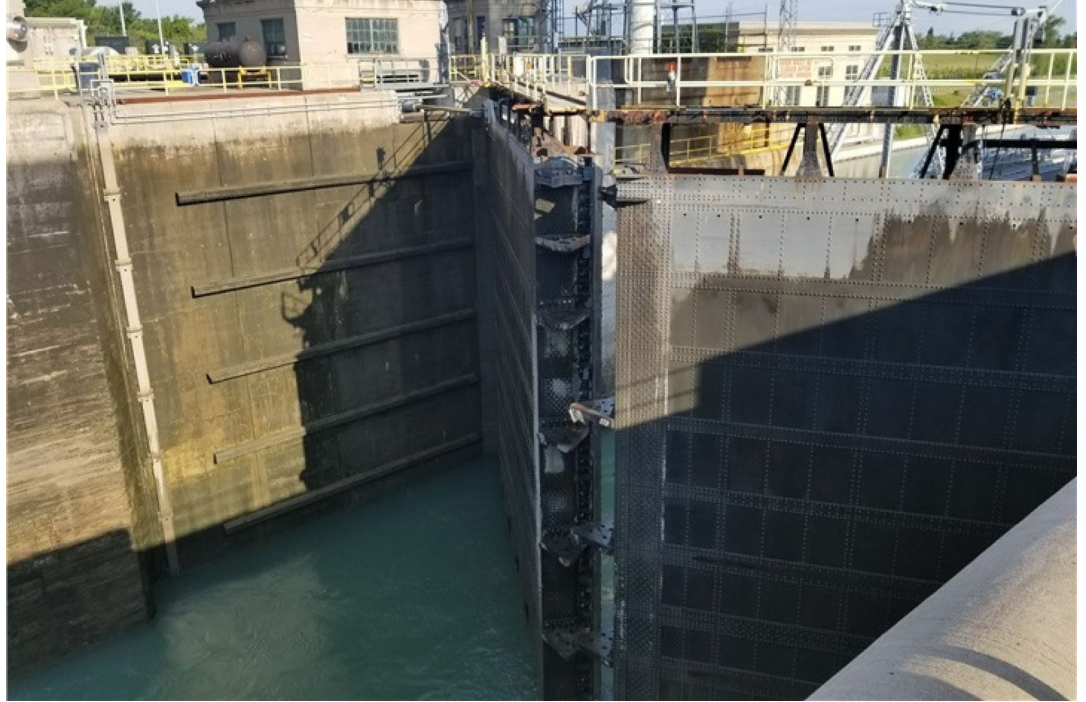
Welland Canal lock in Ontario , connecting Lake Ontario and Lake Erie, part of Canada's St. Lawrence Seaway

The Welland Canal in Ontario, connecting Lake Ontario and Lake Erie, is part of Canada's St. Lawrence Seaway. This critical infrastructure was commissioned in the 1930s. Without proper measures put in place, it will eventually reach its end of life. GKM Consultants was mandated on several occasions to research, design, procure and install monitoring systems. Several different instrument types were installed over the years: crackmeters, strain gauges, accelerometers, convergence meters, and inclinometers. While all of the projects were initially intended as investigative in nature, they have built upon each other with the goal of helping the St. Lawrence Seaway Management Corporation design a comprehensive Structural Health Monitoring (SHM) plan.