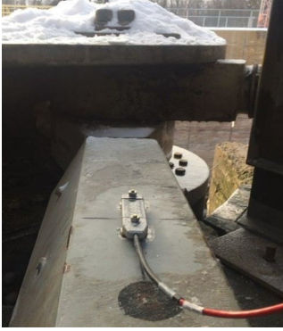
Strain gauges on the gates mechanisms to track dynamic strain during operations