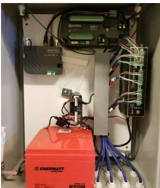
Custom high-speed data loggers