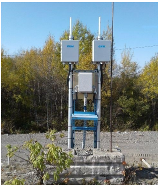
RDMS - Gateway