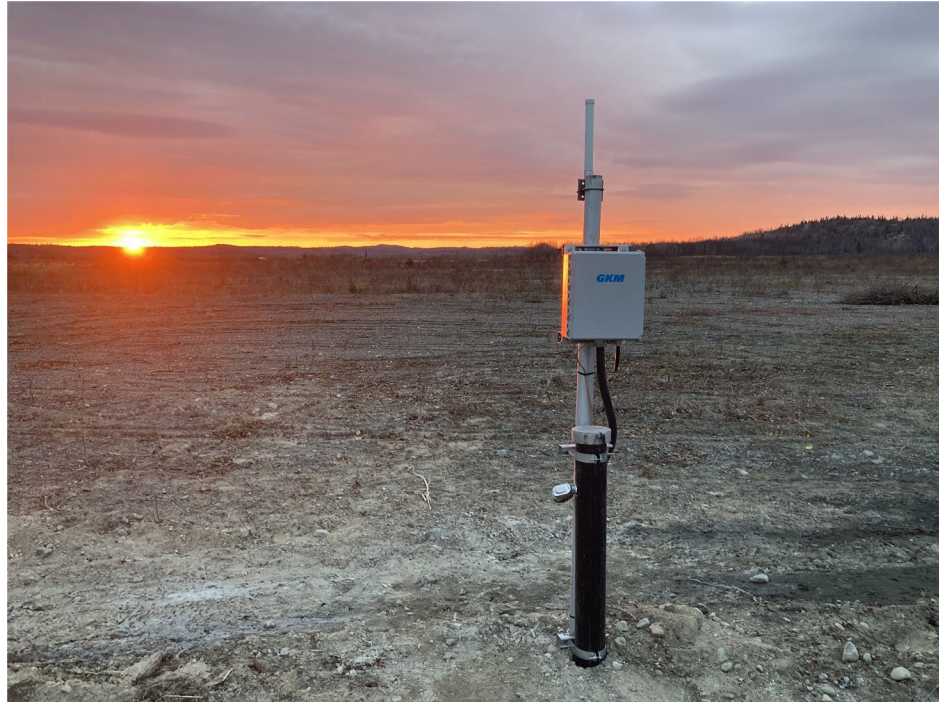
Partially remediated inactive TSF

Tailings storage facilities (TSF) are critical infrastructures related to any mine site and are an integral part of mining resource beneficiation. Risks to TSF physical (geotechnical) and chemical (environmental) stability vary greatly from one mine site to another based on several site-specific variables. One method for TSF owners to manage risk is the implementation of a structural health monitoring (SHM) program. GKM Consultants was mandated to integrate existing and install new instrumentation into one coherent TSF monitoring solution for two remote inactive and partially remediated mining sites overseen by the same operator in northern Canada. The program consists of both geotechnical and environmental components described below. As both sites are remote, isolated, and inactive this client opted for a remote SHM.