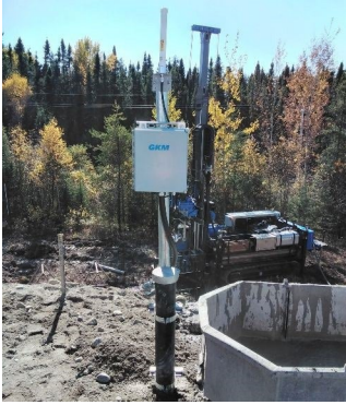
Integration of old and installation of new automated piezometers