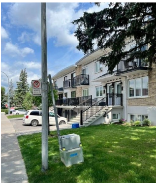
Measurement point location P1