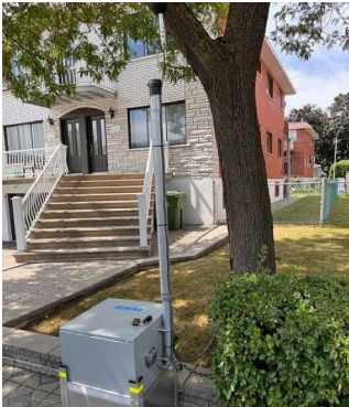
Measurement point location P2