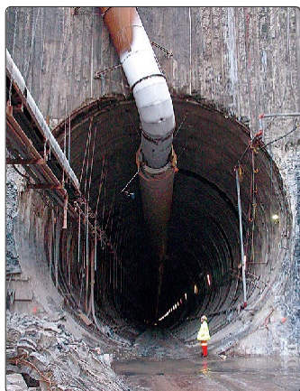
◆ Tunnel entrance