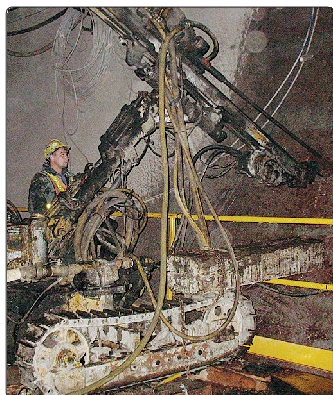
◆ Borehole drilling for extensometer and piezometer installation