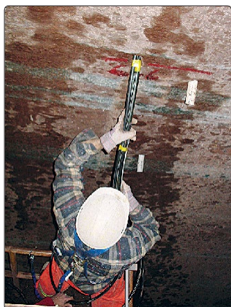
◆ Extensometer installation