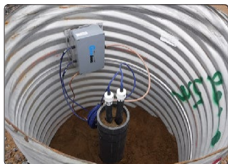
◆ Vibrating wire piezometer surge protector