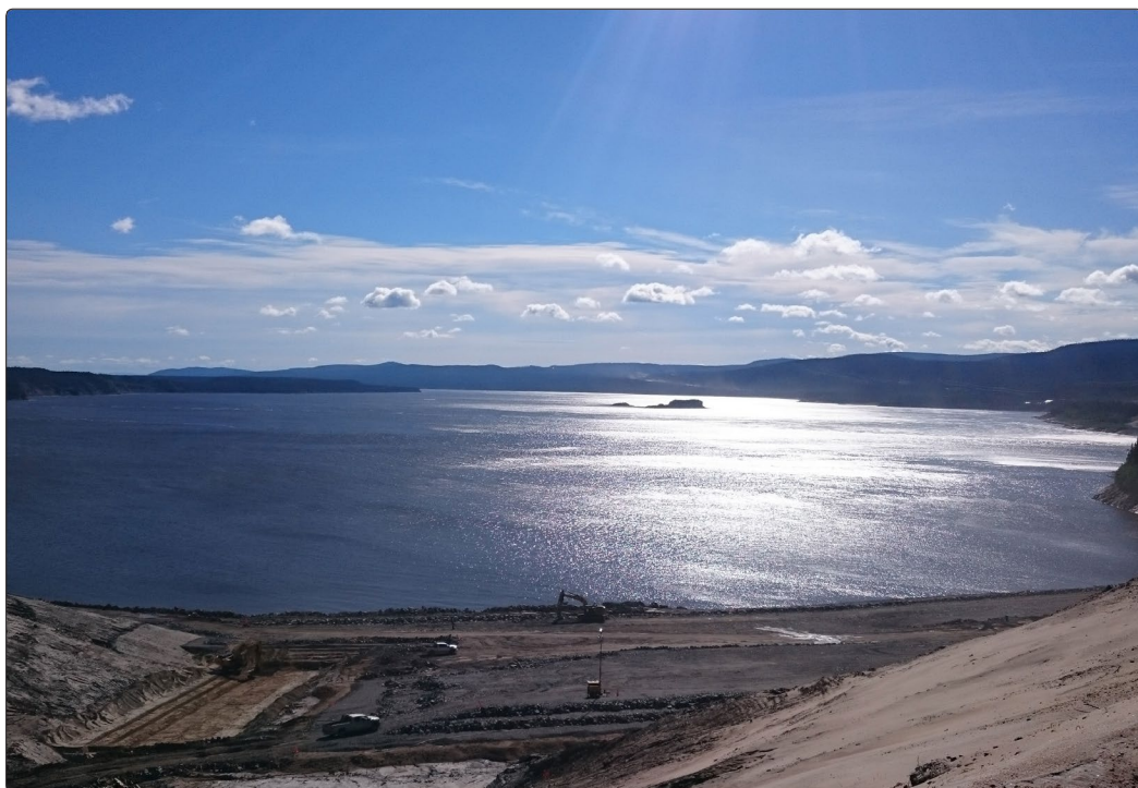
Muskrat Falls – North Spur, downstream view

The Muskrat Falls project, led by Nalcor Energy, consists in the construction of an 824-megawatt (MW) hydroelectric dam on the lower Churchill River in Labrador. Specifically, GKM Consultants was appointed to the North Spur section, a natural barrier that has been reinforced to hold back the rise in water level. Long-term monitoring of this key section is essential to ensure safe operation of the reservoir. GKM scope of work included supply and installation of vibrating wire piezometers and inclinometers, cable routing design and assistance, implementation of an automatic monitoring system, and complete training and handover to client.