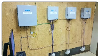
◆ Automatic data acquisition system