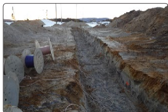
◆ Cable trench