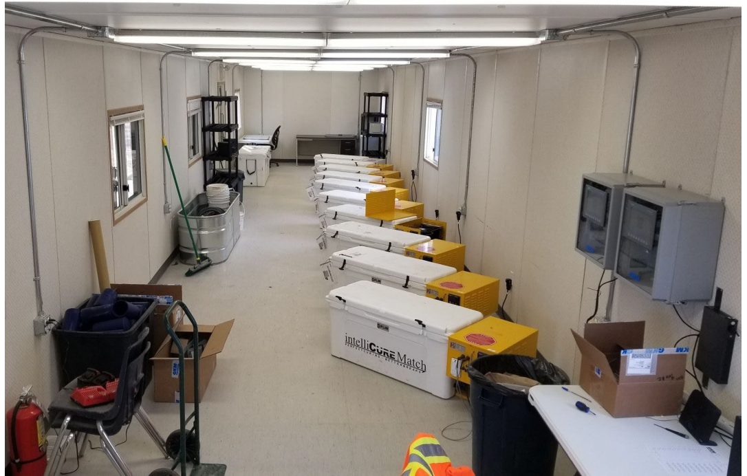
View of the warehouse where the C3 Match are located

Following up on the success of the in-shaft geotechnical instrumentation program at the Jansen mine in Canada, GKM Consultants was mandated by TRL (Thyssen-Redpath-Ledcor) and BHP to design, deploy and commission a large-scale concrete cure match system for the construction of the shaft liner. The challenge that GKM Consultants attacked head-on was that the concrete cylinders produced for quality control had to be cured at the surface at temperatures matching exactly, in real-time, temperatures measured 900 meters underground. GKM Consultants developed and introduced an innovative solution that would allow TRL to go ahead with the construction of the shafts.