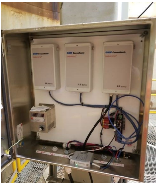
LoRa enclosure that collects data from every individual node