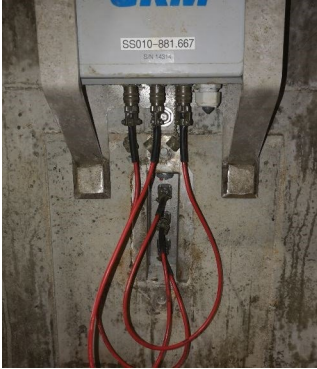
LS-Series node located 900 m underground